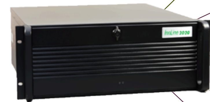
THE INDUSTRY-STANDARD VOICE MESSAGING SOLUTION

EXTENSIVE FEATURE-SET InnLine ™ offers a complete set of features. Hospitality-specific features such as automated wake-up calls, automated guest services, guest voicemail tutorials, automated attendant, and more are included standard on all InnLine ™ voice messaging systems.